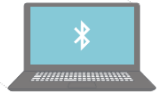
2 ND BLUETOOTH DEVICE